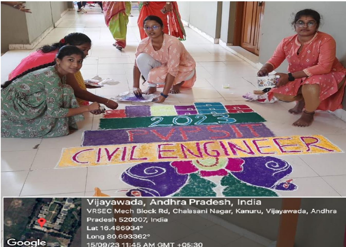
Group –VI (CIVIL)