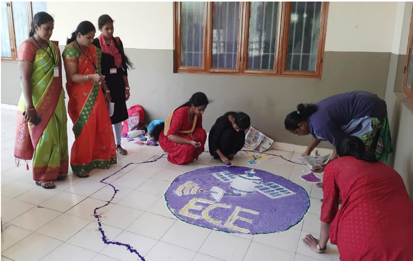
Group- VIII (ECE)